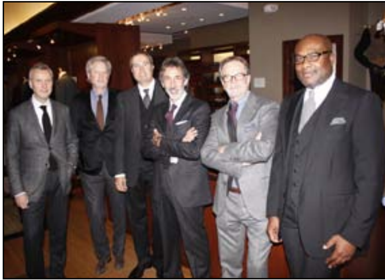
The men of Taylor, Richards & Conger celebrate the store's 25 th Anniversary: