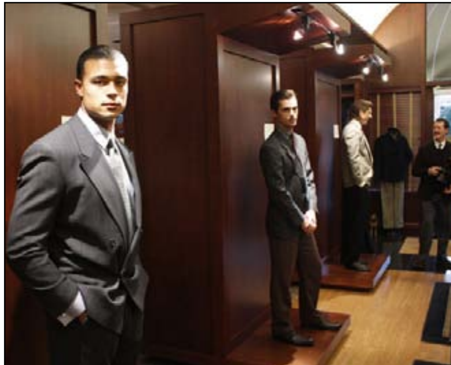
Models showed off menswear trends from the past 25 years.